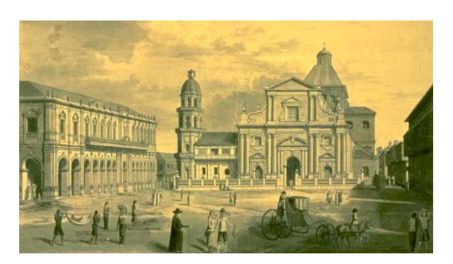
Fig. 2: Intramuros, 1792. On the left side of the Manila is the Ayunatmiento, on the opposite side is the Palacio del Gobernador, the two symbols of Spanish power in the Philippines.

If in all of Spain's empire the church was the most important institutional element, such a situation was most notably true in the Philippines. Nowhere else was a native people Christianized so rapidly, and nowhere else did the missionaries lead so conspicuously in fashioning the culture of an indigenous population.<sup>6</sup>