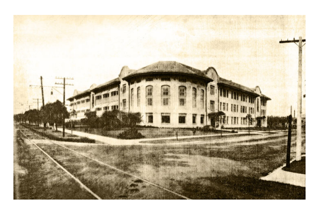
Fig. 4: Philippine Normal School (1900's)

Center for Teacher Education by virtue of R.A. 9647 on June 30, 2009.