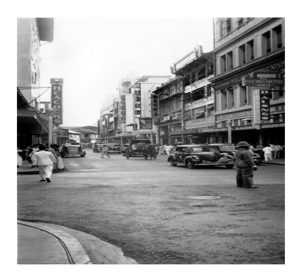
Fig. 3: Escolta with horse-drawn tranvia (1910) and Escolta (1935)